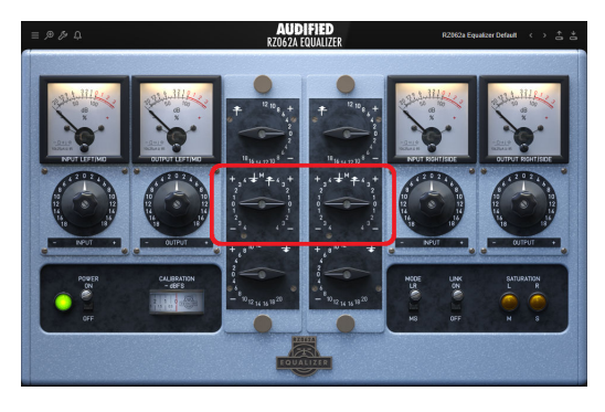
• The B Type has a presence filter

• The A type has standard mid-frequency control